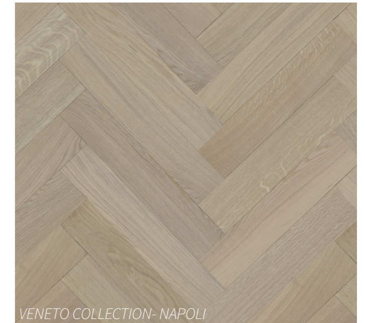
VENETO COLLECTION- NAPOLI

PLEASE NOTE: As hardwood is a product of nature, the appearance and variation of your installed floor may differ slightly from what is represented in these swatches. Please visit our website or retail partner for larger swatch images of each colour. All colours shown here are part of our standard collection.