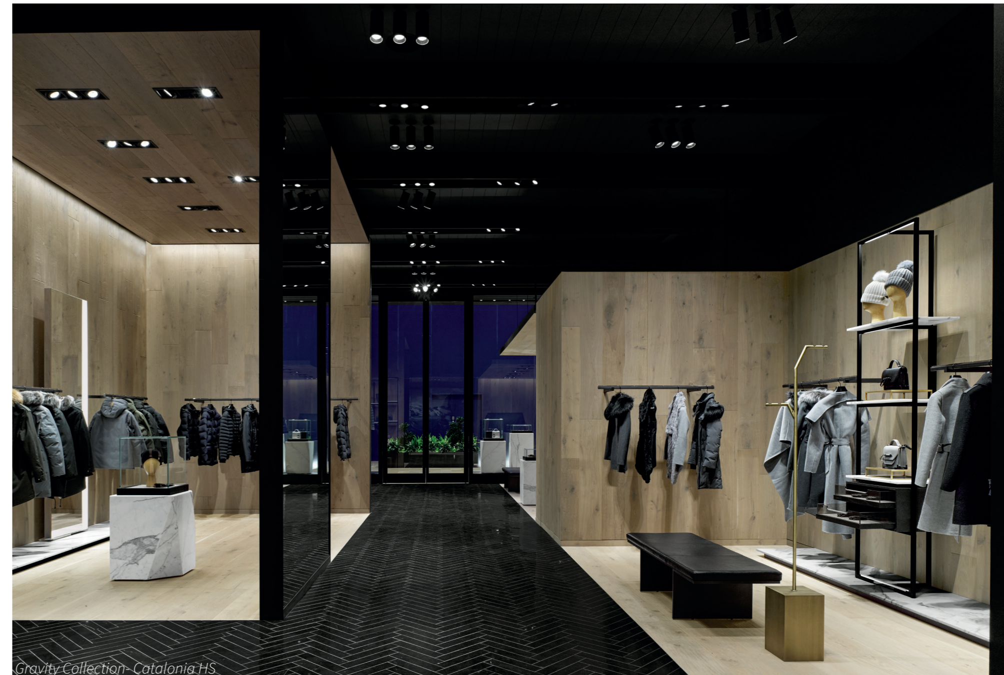
Gravity Collection - Catalonia HS

We believe your floors should be as unique as your space. While we offer a curated selection of standard options, our customization goes far beyond. Imagine the freedom to pair any colour from our collections with your preferred grade or width, crafting a floor that's truly one of a kind. This seamless blend of versatility and artistry ensures your vision comes to life, down to the finest detail.