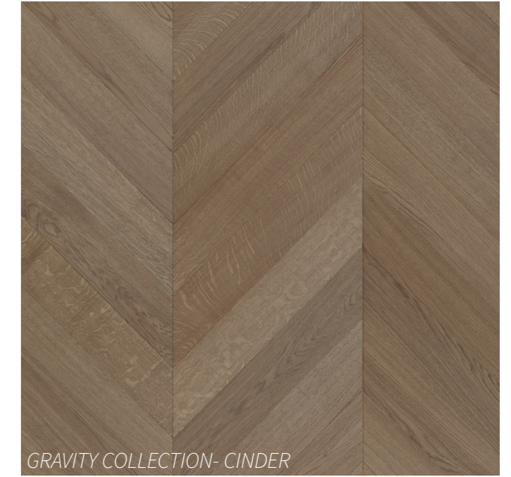
GRAVITY COLLECTION- CINDER

PurParket offers two standard sizes for herringbone: 4.7" x 23.6" and 5.5" x 29.13", and chevron: 5.5" x 30".