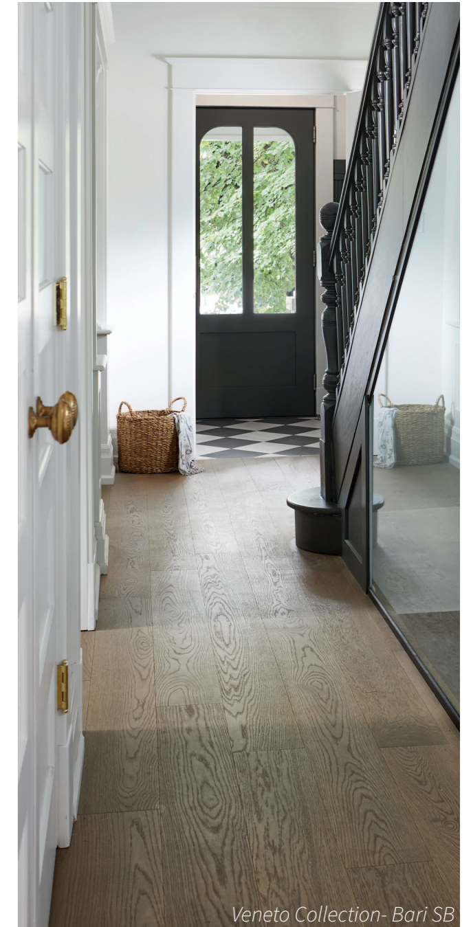
Veneto Collection- Bari SB

PLEASE NOTE: As hardwood is a product of nature, the appearance and variation of your installed floor may differ slightly from what is represented in these swatches. Please visit our website or retail partner for larger swatch images of each colour. All colours shown here are part of our standard collection.