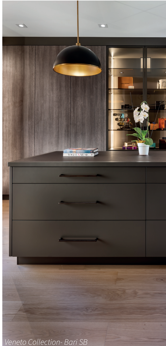
Veneto Collection- Bari SB